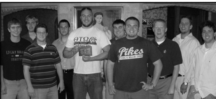
Executive Council displaying the Order of Omega award, given to only one chapter who displays the best chapter programming.