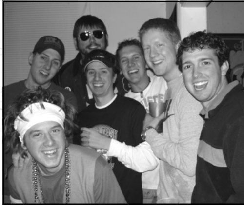
Pledge brothers of Fall '03 celebrate St. Pat's in style at Mean Phish, a property rented by the members.