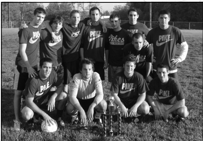
A Team soccer displays trophy after an undefeated season.