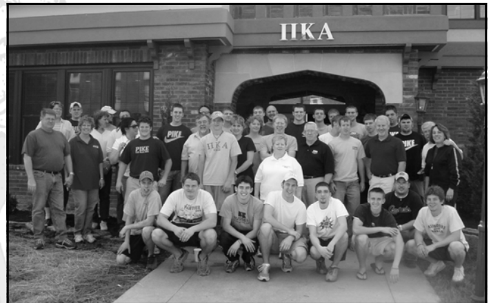
International Work Day crew in front of the Chapter house

On April 19th, the brothers of Alpha Kappa and their parents joined together to take part in the IKA International Work Day. Approximately 25 parents, two alumni, and 55 actives came to help beautify the house and the surrounding landscape. Projects included mulching, re-bricking the side and back patio, and various interior projects where needed. In the afternoon, parents joined the brothers on a enjoyable trip the St. James wineries. That evening, everyone relaxed on the patio while barbequing and socializing.