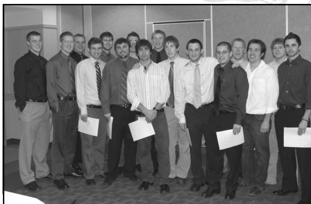
Men of Alpha Kappa display their scholastic awards.

At the banquet, the Educational Foundation distributed over $22,000 in scholarships to 40 members. The categories included GPA, leadership performance, community service, and campus involvement.