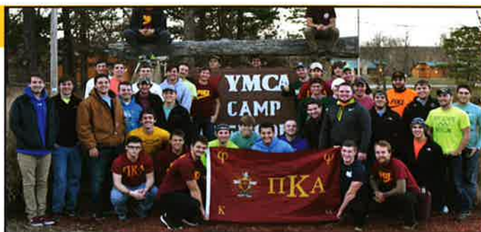
PHOTO: Over 40 Alpha Kappa members provided their service this semester at the YMCA Camp in Potosi, MO.

is that after all the work is done for the day, we can hang around the fire with our brothers and tell stories of our times in this great fraternity. The hard work we put into helping out around Potosi is greatly appreciated by the entire camp and we cannot wait until the next semester when we can return and continue to donate our service.