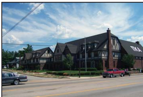
Front View of the Entire House

The contractor's "heavy work" was completed on the main structures on July 13th with punch list corrections, cleaning, and fine-tuning to finish within two weeks. Construction workers will still be around the property for a short period of time to finish the outdoor activities, such as parking lot paving, landscaping, outdoor cleanup and other small activities to achieve perfection. New