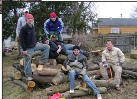
Right: Group of Pikes take a picture after cutting a tree that had fallen from the storm.