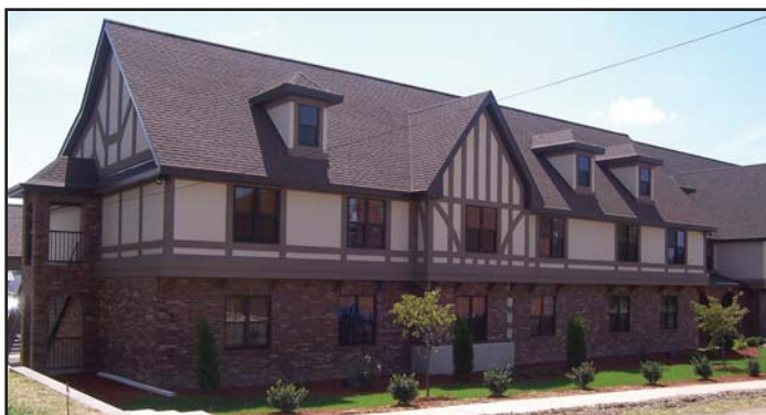
Front View of the New Addition