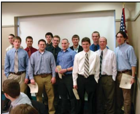
The Alpha Kappa 3.5 - 3.79 Scholarship Recipients

This past Founders Day, celebrated on March 3, 2007, over $16,000 in awards was presented to Alpha Kappa brothers. A total of 52 awards were given with 47 members receiving one or more awards. Scholastic awards totaled $12,150; leadership awards totaled $4,150; and two memorial awards were presented totaling $150. The Founders Day event was the second AK award ceremony held during the year. The annual Scholarship Awards Banquet is held each year during the Fall semester. Last year over $42,500 was distributed to 61 different chapter members during the scholarship awards banquet held during the UMR Homecoming weekend.