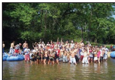
Summer Float Trip

Shortly after the tri-folds were mailed, a group of members participated in a rush "phone-a-thon" in order to contact all 900 interested men. The phone-a-thon ensured every possible rush was contacted and that men who fit the mold of a PiKA were pursued in the future. If the incoming freshman only provided an email address, an email was sent to them that gave a brief overview of AK and other information included in the tri-fold described above. This initial contact with the freshman was one of the most difficult and