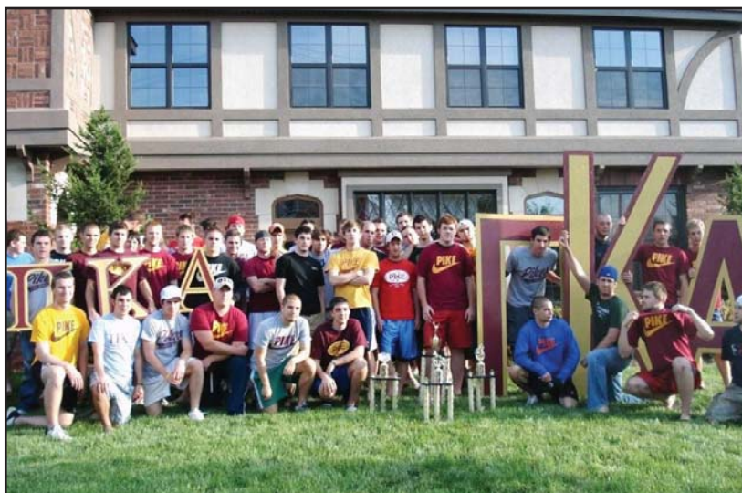
Celebrating the overall championship!