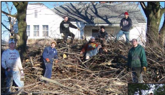
Above: Group of Pikes pause to take a picture while clearing brush from an elderly Springfield resident's yard

of dollars in damage to Springfield residents. It was a touching occasion for all that were affected and the Pikes were more than happy to provide support after the disaster.