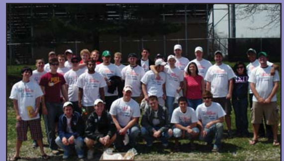
Group of Pikes volunteering at the Special Olympics