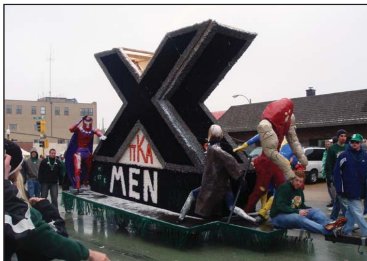
The Pi Kappa Alpha "X-Men" Float

Alpha Kappa continued to show a strong return to the St. Pat's competition in the 2007 celebration. Even though the chapter was still gaining experience in the competition, the men of Alpha Kappa excelled in multiple aspects of the celebration, allowing PiKA a chance to dominate the competition in the upcoming centennial. The chapter took third place for its "X-Men" float and first in many events at Follies including giant pong. The Pikes also won numerous awards at Gonzo and Games including second in shillelagh toss. Due to the exceptional showings and amount of time devoted to the Fall special events, the Brothers were unable to make a cudgel for this year's competition. However, this situation allowed for the chapter to not only obtain knowledge about making a cudgel, but also actually begin work on the cudgel that AK will use in the next St. Pat's. Through hard work and planning, the 99th celebration has allowed the Pikes to be a main contender for first place at the 100th annual St. Pat's.