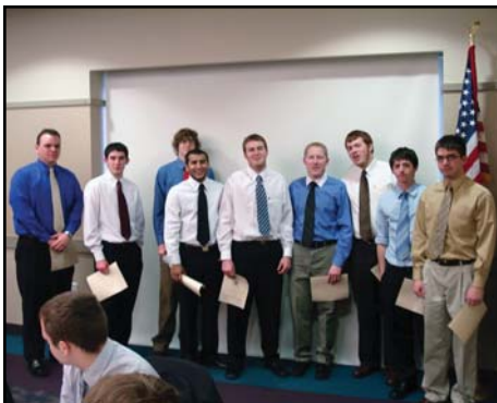
The Alpha Kappa 3.2 - 3.49 Scholarship Recipients