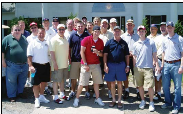
Group Picture of all participants