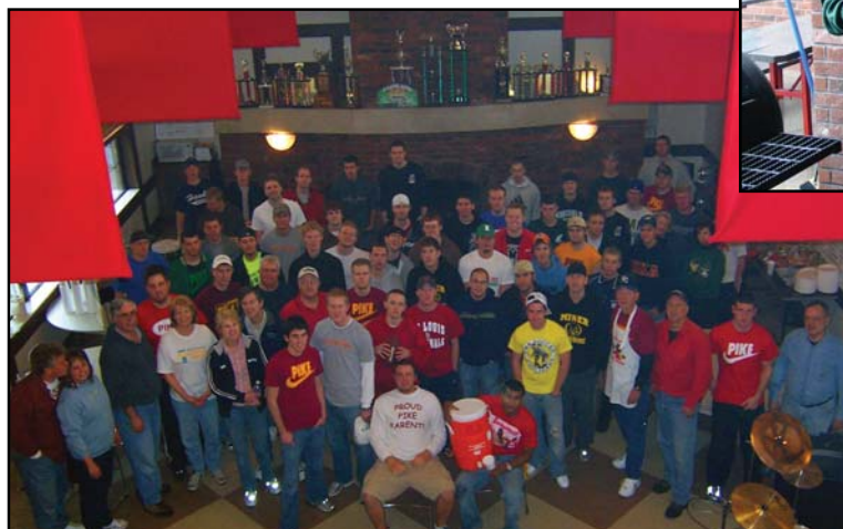
Group of participating Pikes and their parents.

On April 14th, the men of Alpha Kappa, along with the help of many PiKA parents, participated in International Work Day. Due to weather complications, the numerous improvements to the house were forced to be kept almost entirely indoors. The improvements to the house included steam cleaning the carpets, polishing the wood furniture, and power-washing the patio. A large amount of time and energy were also put into cleaning and repairing "The Palace," the temporary annex that was leased in order to house the brothers who were unable to live in house due to space limitations. The Chapter also used the occasion to host the annual "Parent's Day." A barbeque was held afterward to thank all for the help and support. The event was a wonderful success and fun was had by all while making the house look great.