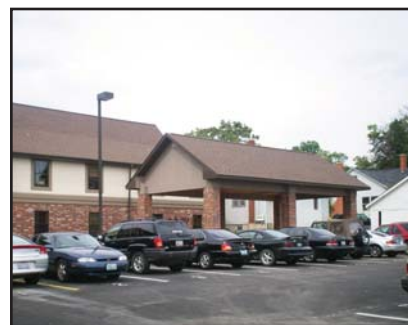
Pavilion from parking lot

The improved 104-man chapter house now has walk-in refrigerator and freezer units for the kitchen and other minor food-related revisions to handle the larger house eating