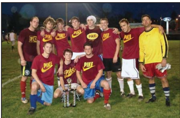
A Team Soccer - Champions