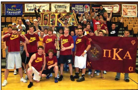
A Team Basketball - Champions